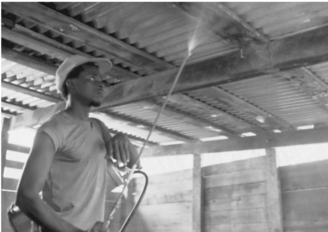
Anti-malarial spraying in Guyana. The British medical journal The Lancet reported that no adverse effects of DDT were ever experienced by the 130,000 spraymen or the 535 million people living in sprayed houses during 1959.

backing the indoor spraying program, and slamming the latest permutation in the DDT scare stories, that DDT lowers sperm levels and quality. The statement notes, “We believe that the Department of Health is correct in its choice of DDT in its malaria control program, and as scientists, medical practitioners, and public health professionals, endorse its use.”