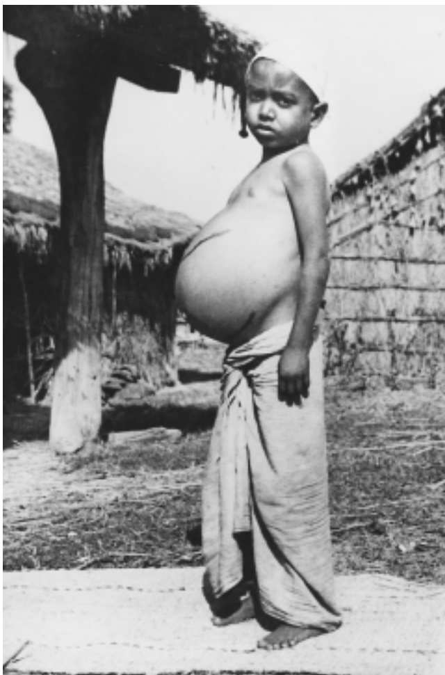
A typical malaria victim in 1950, before DDT was widely used. The child's spleen is enormously enlarged, one of the symptoms of malaria infection.

American markets where organic food products fetch exorbitant prices.”